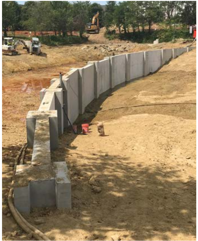
Using precast concrete products was more cost- and time-effective to construct the base for the bridge thanks to its ease of installation.

top of it, required hammerheads on top of the columns and abutments, serving the spans within the bridge.