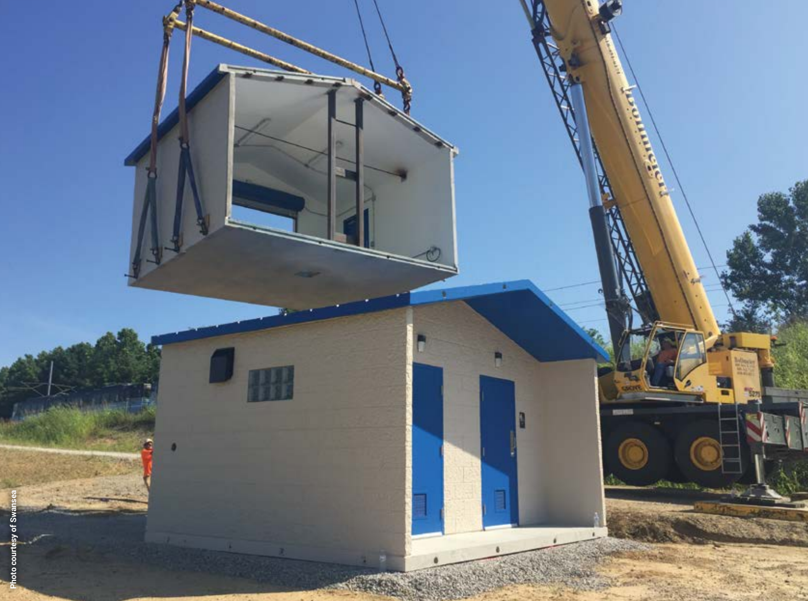
Using a modular precast concrete building gave an Illinois park a quick and easy solution for its restrooms and storage unit.