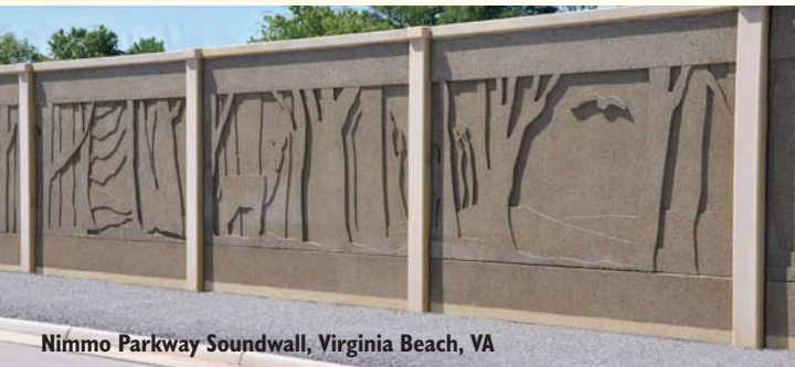
Nimmo Parkway Soundwall, Virginia Beach, VA