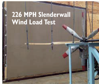
226 MPH Slenderwall Wind Load Test