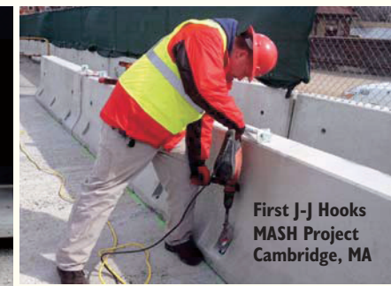
First J-J Hooks MASH Project Cambridge, MA

SMITH-MIDLAND® EXCELLENCE IN PRECAST CONCRETE