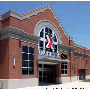
Fort Belvoir PX, VA