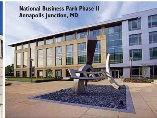
National Business Park Phase II Annapolis Junction, MD