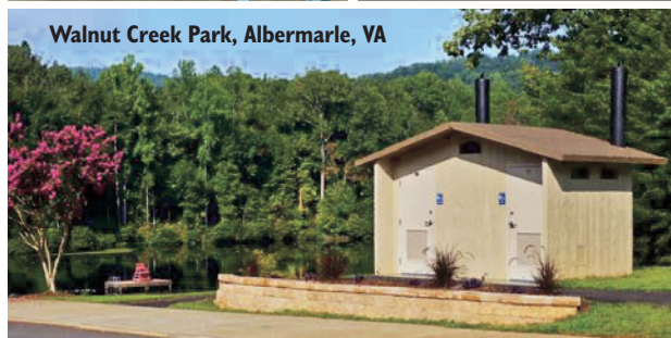
Walnut Creek Park, Albermarle, VA