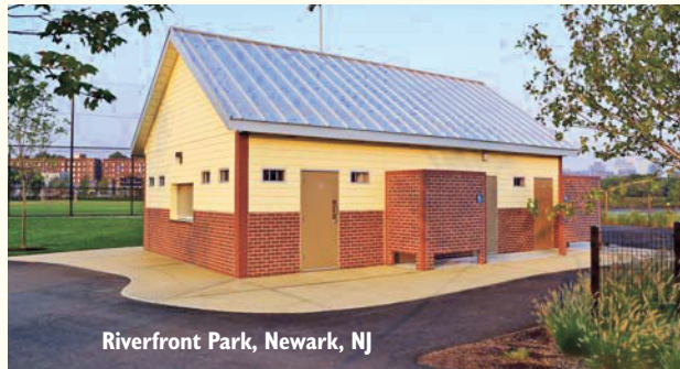
Riverfront Park, Newark, NJ