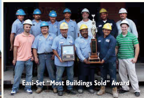
Easi-Set "Most Buildings Sold" Award