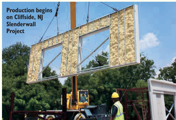
Production begins on Cliffside, NJ Slenderwall Project