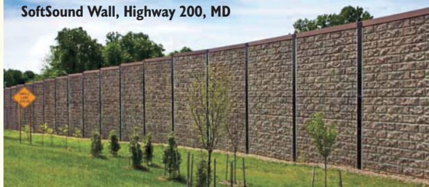
SoftSound Wall, Highway 200, MD