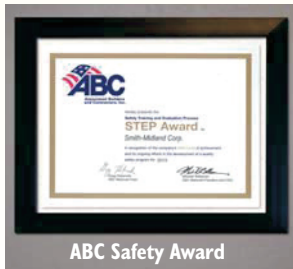
ABC Safety Award