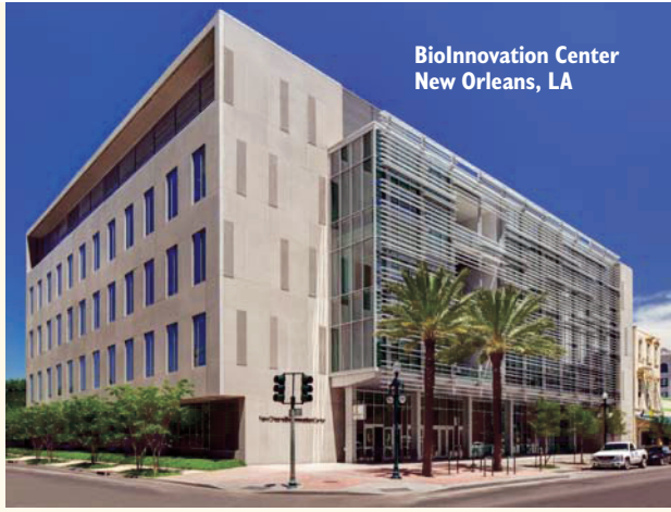
BioInnovation Center New Orleans, LA