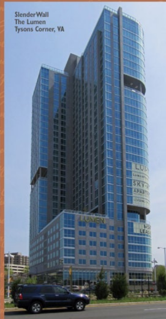
SlenderWall The Lumen Tysons Corner, VA