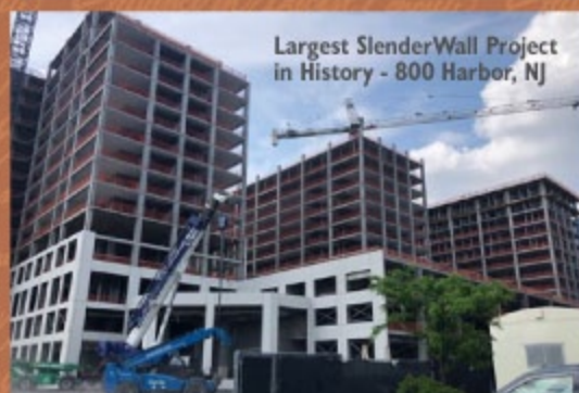
Largest SlenderWall Project in History - 800 Harbor, NJ