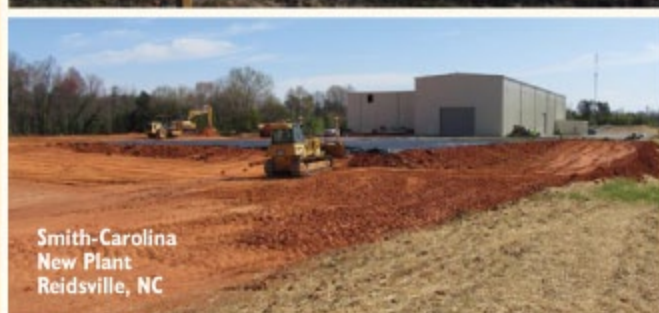
Smith-Carolina New Plant Reidsville, NC