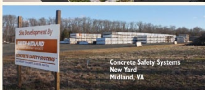
Concrete Safety Systems New Yard Midland, VA