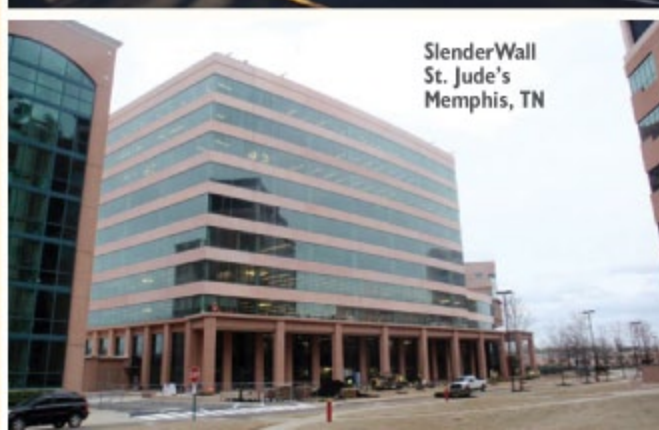
SlenderWall St. Jude's Memphis, TN