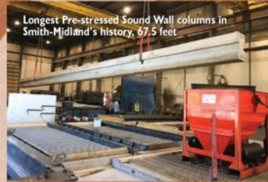
Longest Pre-stressed Sound Wall columns in Smith-Midland's history, 67.5 feet