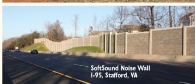
SoftSound Noise Wall I-95, Stafford, VA