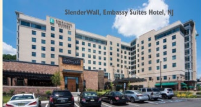
SlenderWall, Embassy Suites Hotel, NJ