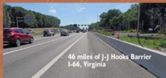
46 miles of J-J Hooks Barrier I-66, Virginia