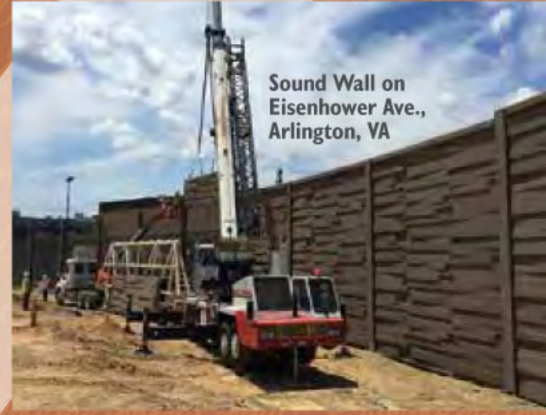
Sound Wall on Eisenhower Ave., Arlington, VA