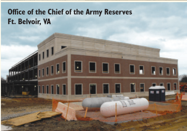
Office of the Chief of the Army Reserves Ft. Belvoir, VA