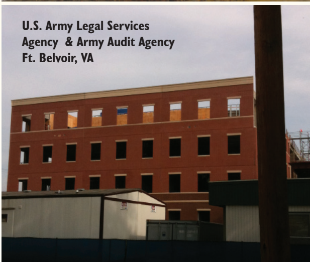
U.S. Army Legal Services Agency & Army Audit Agency Ft. Belvoir, VA