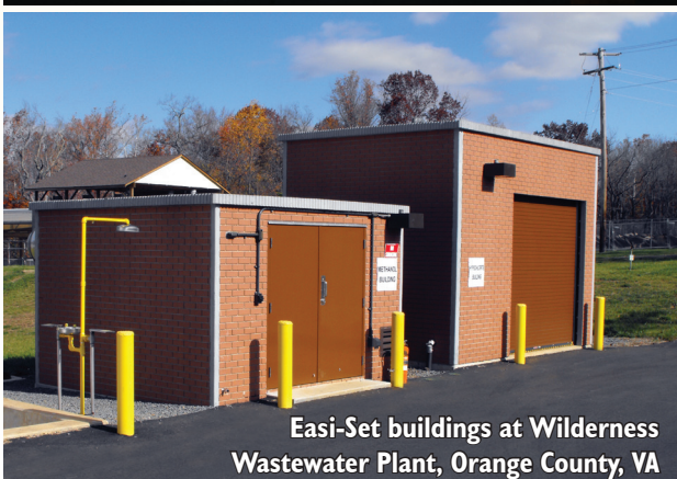
Easi-Set buildings at Wilderness Wastewater Plant, Orange County, VA