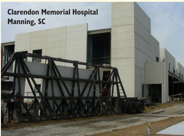
Clarendon Memorial Hospital Manning, SC