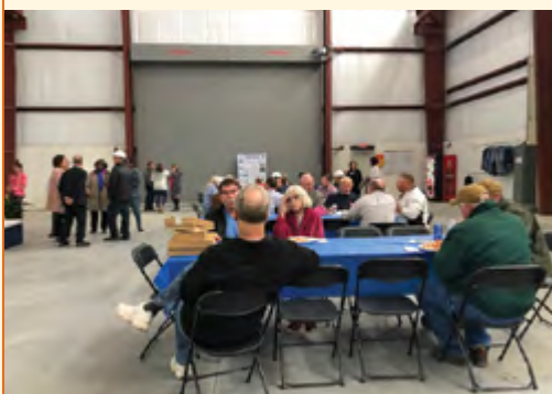
Smith-Carolina event at the new plant