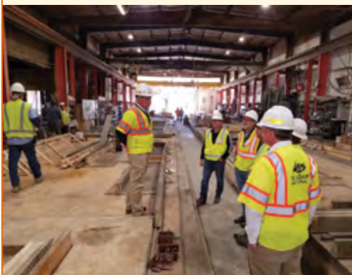
Smith-Midland plant tour