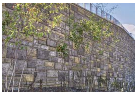
National Precast Concrete Association