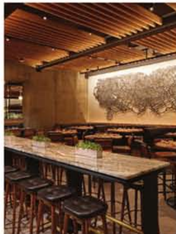
Interior of Earls, showing stylized map of DC on near wall.

Project: Earls, 7902 Tysons One Place, Tysons, VA