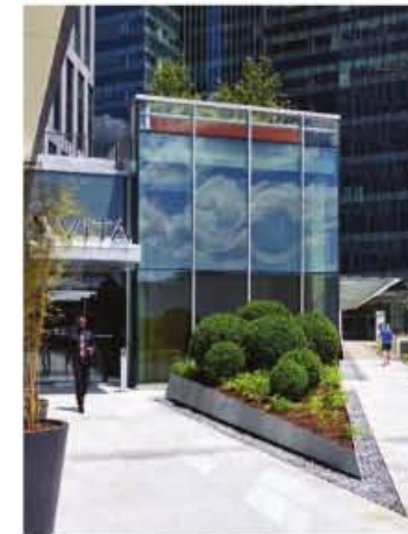
Main entrance to building.