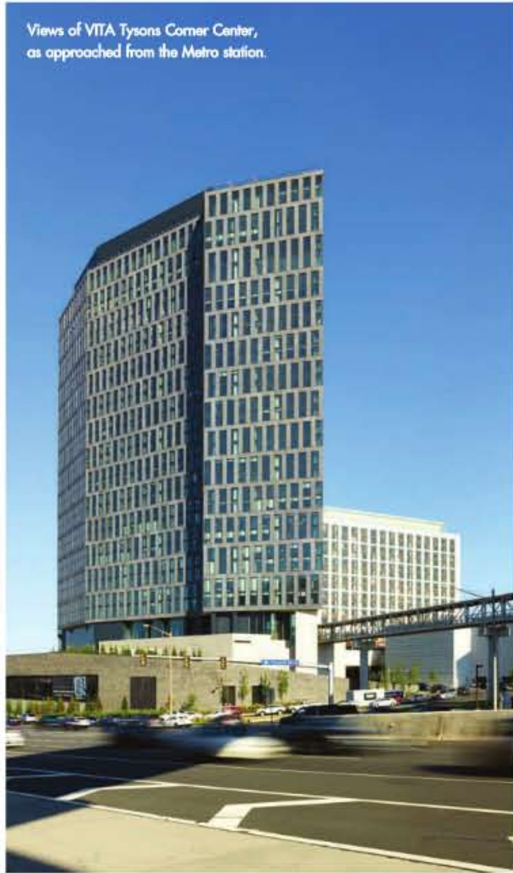
Views of VITA Tysons Corner Center, as approached from the Metro station.