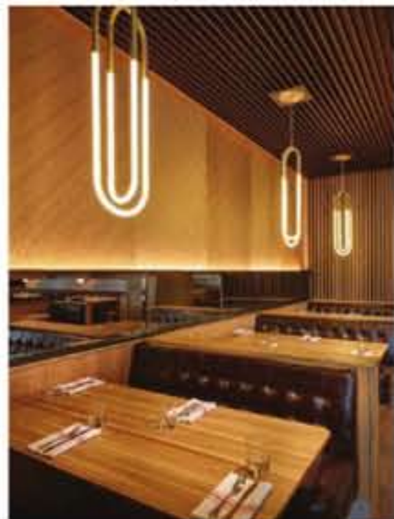
Interior of Earls, showing "paper clip" light fixtures.