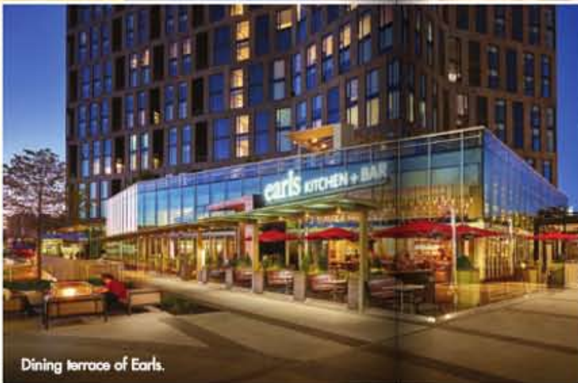
Exterior view of Earls.