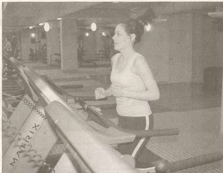
BY SARAH ABBUZZESE FOR THE WASHINGTON POST