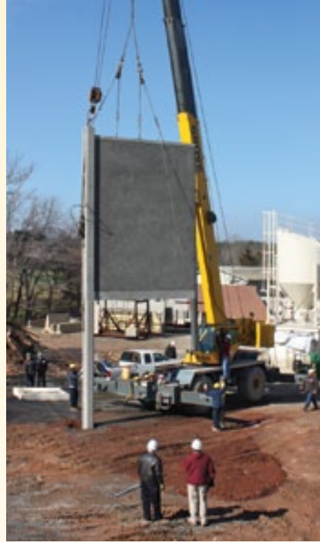
SierraWall II, our latest innovation. A one-piece post & panel sound wall, designed to save our customers on both manufacturing and installation costs.

Installation: Appropriate foundation piers are completed prior to delivery of the sound wall. As each panel and post is off-loaded, it is slipped into the adjacent section with a secure tongue and groove connection. Installation is completed by welding or bolting the steel mounting plates (stainless plates are optional) on the foundation piers and the plates on the base of the posts.