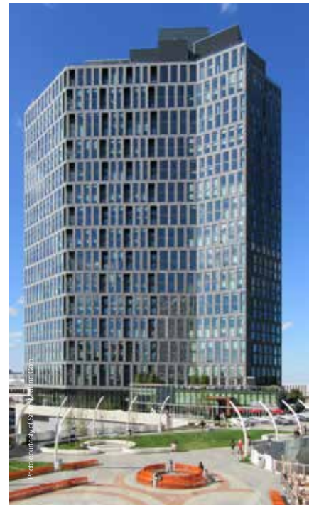
The VITA building in Tysons employs precast concrete panels with a unique shape and color to create a shape that implies a weave, like fabric.