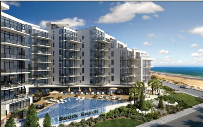
South Beach at Long Branch