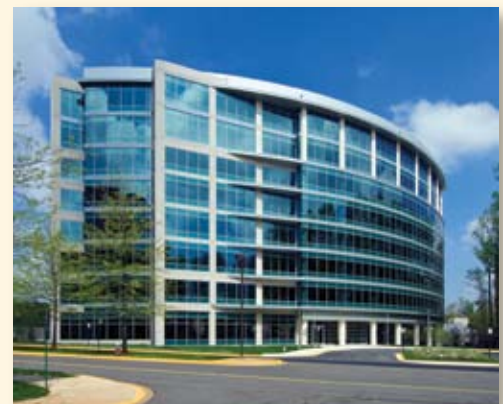
3120 Fairview Park Dr, Falls Church, VA