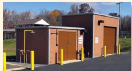
Easi-Set buildings at WWTP

The buildings are scheduled to be delivered during the first half of 2010. The project is scheduled to be completed in the first quarter of 2011.