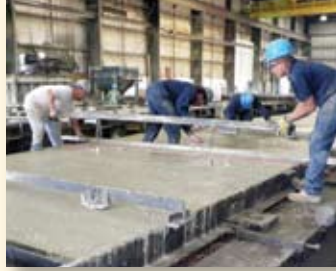
I-66 Panel Production

SMC is supplying 52,020 sq. ft. of precast/prestressed concrete slabs (306 pieces) with a light broom finish to support the VDOT pavement-rehabilitation project. The prestressed slabs will be post-tensioned together at the site after they are placed on the sub-grade. The project began in August of 2009.