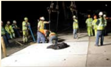
I-66 Panel Installation

The Highways for LIFE program is designed to build highways faster, safer, with better quality, at less cost, and less work zone congestion. They are also designed to make the projects last longer and be less costly to maintain. “Using new building methods