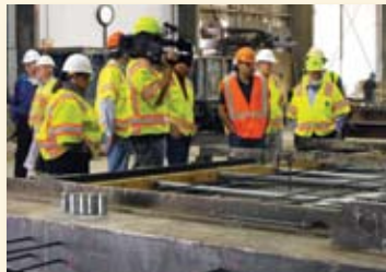
DOT Plant Visit

SMC is very excited about this ground breaking project and proud of the associates who are working on it. As a show of appreciation, SMC